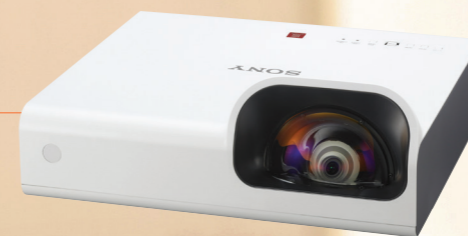
VPL-SW225 / VPL-SX225 WXGA and XGA with 2600~2700 lumens brightness

The projector includes a 16W monaural speaker.