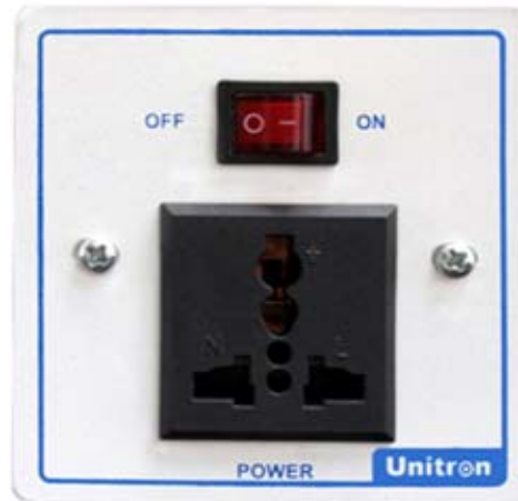
WFP-PSP-488 POWER, SWITCH