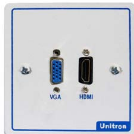
WFP-PSP-444 VGA, HDMI