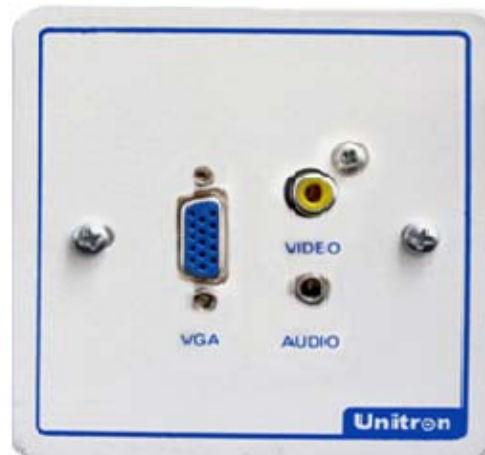
WFP-PSP-500 VGA, Audio, Video