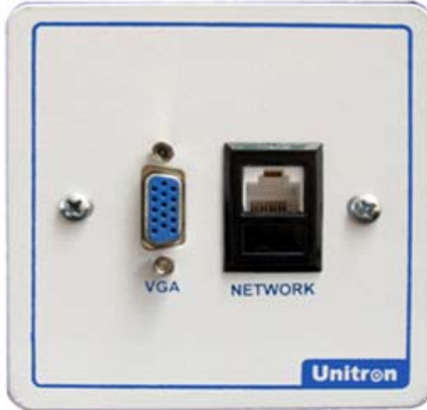
WFP-PSP-466 VGA, LAN