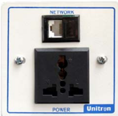
WFP-PSP-477 POWER, LAN