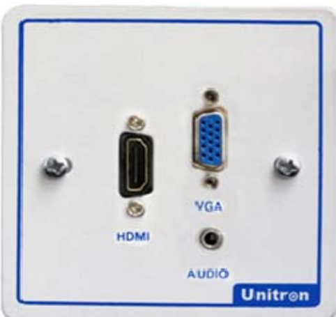
WFP-PSP-499 VGA, HDMI, Audio