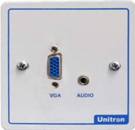
WFP-PSP-455 VGA, Audio