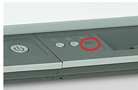
Ready Light on pen tray of 800 series board

NOTE: After you turn on your computer, the Ready light is red while the SMART Board interactive whiteboard and the computer establish communication.